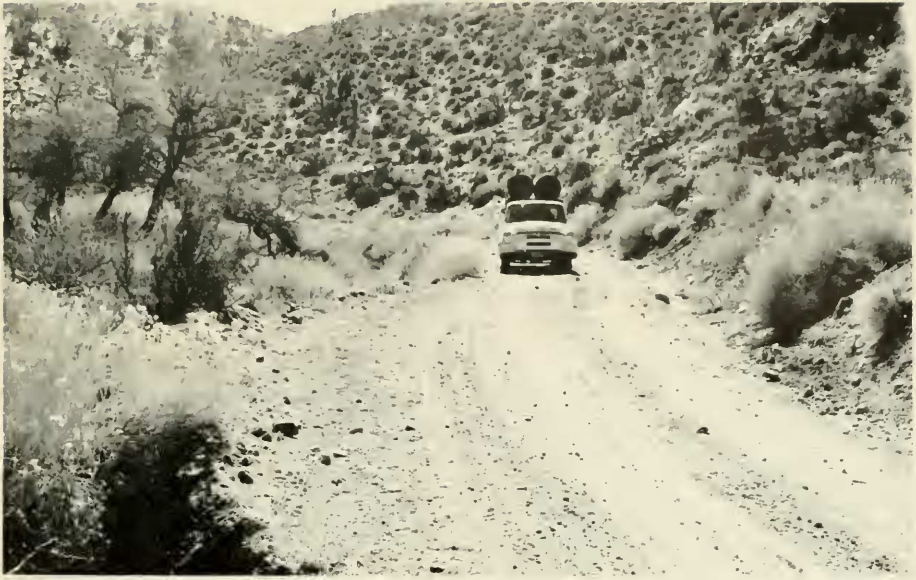
Figure 2. Nelson Mountains, Grapevine Canyon. Elevation 5100 feet. Station 11 (left) and station 12 (right). March 1959. These two stations were adjacent to one another, and were the only ones that were not at least 0.2 of a mile apart in Grapevine Canyon. An adult female of Gerrhonotus panamintinus was trapped in a buried can and collected on September 16, 1960 at Station 12. It is interesting to note that in this particular instance where there was a mesic environment on one side of the road and a xeric situation on the other, the specimen of G. panamintinus was obtained in the latter, a phenomenon which was not anticipated.